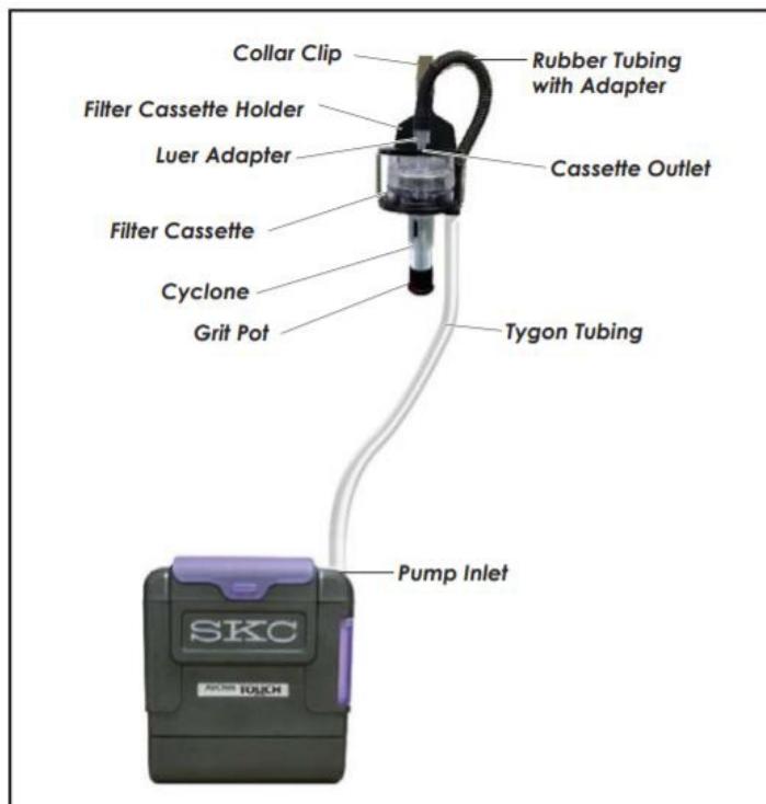
Figure 3. Sampling train with filter cassette and Aluminum Cyclone in Filter Cassette Holder

When ready to start sampling, prepare a new filter cassette identical to the one used for verifying the flow rate. Mount the cassette on the cyclone as directed in Step 1. Insert the loaded cassette/cyclone assembly into a filter cassette holder with the cyclone stem facing down. Secure the cassette with the spring-loaded hold-down plate and insert the adapter on the end of the short piece of spring reinforced rubber tubing into the cassette outlet. Connect the long piece of Tygon tubing to the pump inlet. Clip the filter holder to a worker's collar in the breathing zone and the pump to the worker's belt. The cyclone stem should be in a vertical position facing down. Turn on the pump. Note the start time and any other pertinent sampling information.